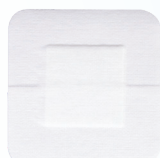
Actolind® Wound Pad Adhesive / Transparent Highly retentive wound dressing