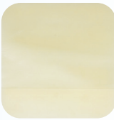
Actolind® Hydrocolloid Hydrocolloid adhesive, absorbent, waterproof wound dressing

We offer optimal solutions for wound healing thanks to modern wound care dressings designed with the clinical experience we have accumulated in wound care.